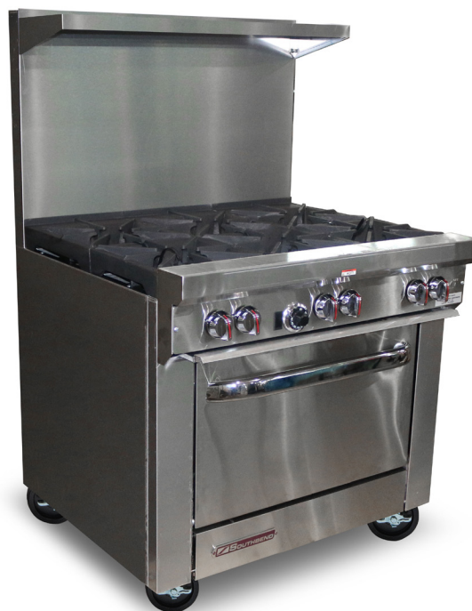
(S36D shown with optional casters)

S36D - 6 Open Burners, Standard Oven S36A - 6 Open Burners, Convection Oven S36C - 6 Open Burners, Cabinet Base