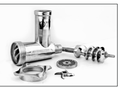
MEAT GRINDER ATTACHMENTS