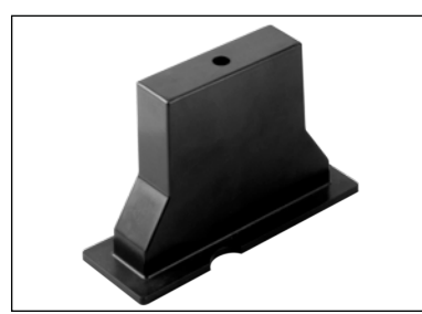
FOOD TRAY SUPPORT