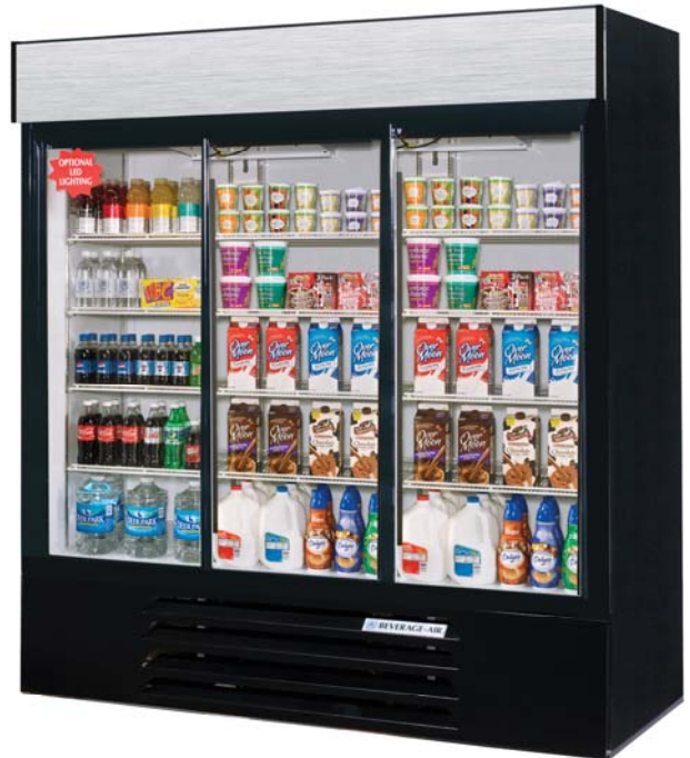
LV72Y-1-B (shown with 4 shelves per section)

Units wired at factory and ready for connection to a 115/60/1 phase, 15 amp dedicated outlet. 8' long cord and plug set included.