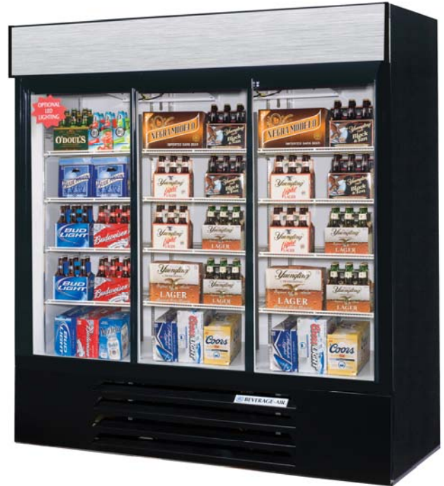
LV66Y-1-B (shown with 4 shelves per section)

MODEL: LV66Y-1-B LV66Y-1-W LV66Y-1-B-LED LV66Y-1-W-LED