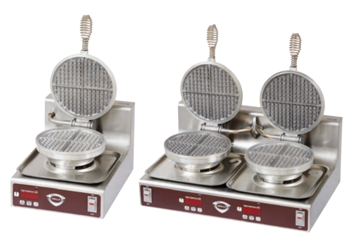
Models WB-1E & WB-2E