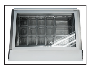
Glass Lid Top

This product is equipped with a fine mesh filter to the front of the condenser to catch dust, and a rotating brush that moves up and down daily to remove excess buildup outward and away.