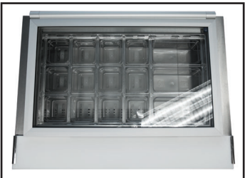
Glass Lid Top